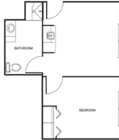
One Bedroom starting at..... $3,900