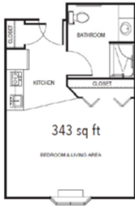
Studio starting at.....$2,900