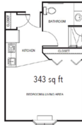
Companion Studio starting at..... $2,400