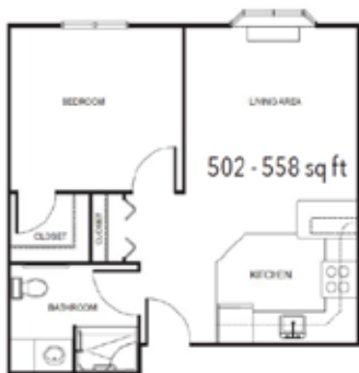
One Bedroom starting at.....$3,600