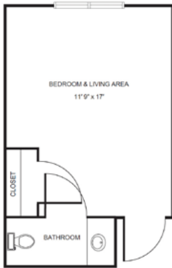
Studio starting at.....$3,050