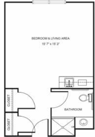
Deluxe Studio starting at.....$3,675