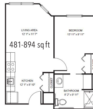
One Bedroom starting at.....$3,475