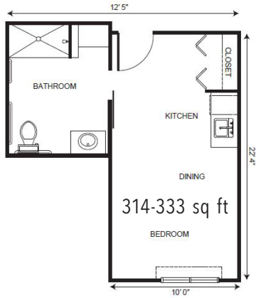
Studio starting at.....$3,675