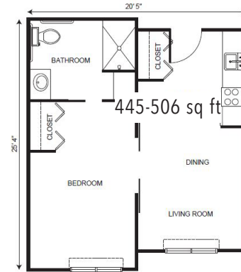
One Bedroom starting at.....$4,175